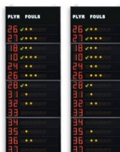
Art.262B FS-414B statistics panels, 2x14 Players (Player No. + Fouls)

Size: 2x 120x320x11,5cm. - Weight: 165kg.