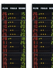
Art.262C FS-414C statistics panels, 2x14 players (Player No. +Fouls +Points)

Size: 2x 120x320x11,5cm. - Weight: 168kg.