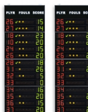
Art.262C FS-414C statistics panels, 2x14 players (Player No. +Fouls +Points)

Size: 2x 120x320x11,5cm. - Weight: 168kg.