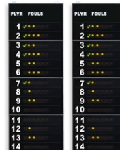
Art.262A FS-414A statistics panels, 2x14 players ( Fouls )

Size: 2x 120x320x11,5cm. - Weight: 165kg.