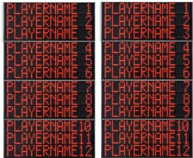
Item codes and prices (not including VAT)